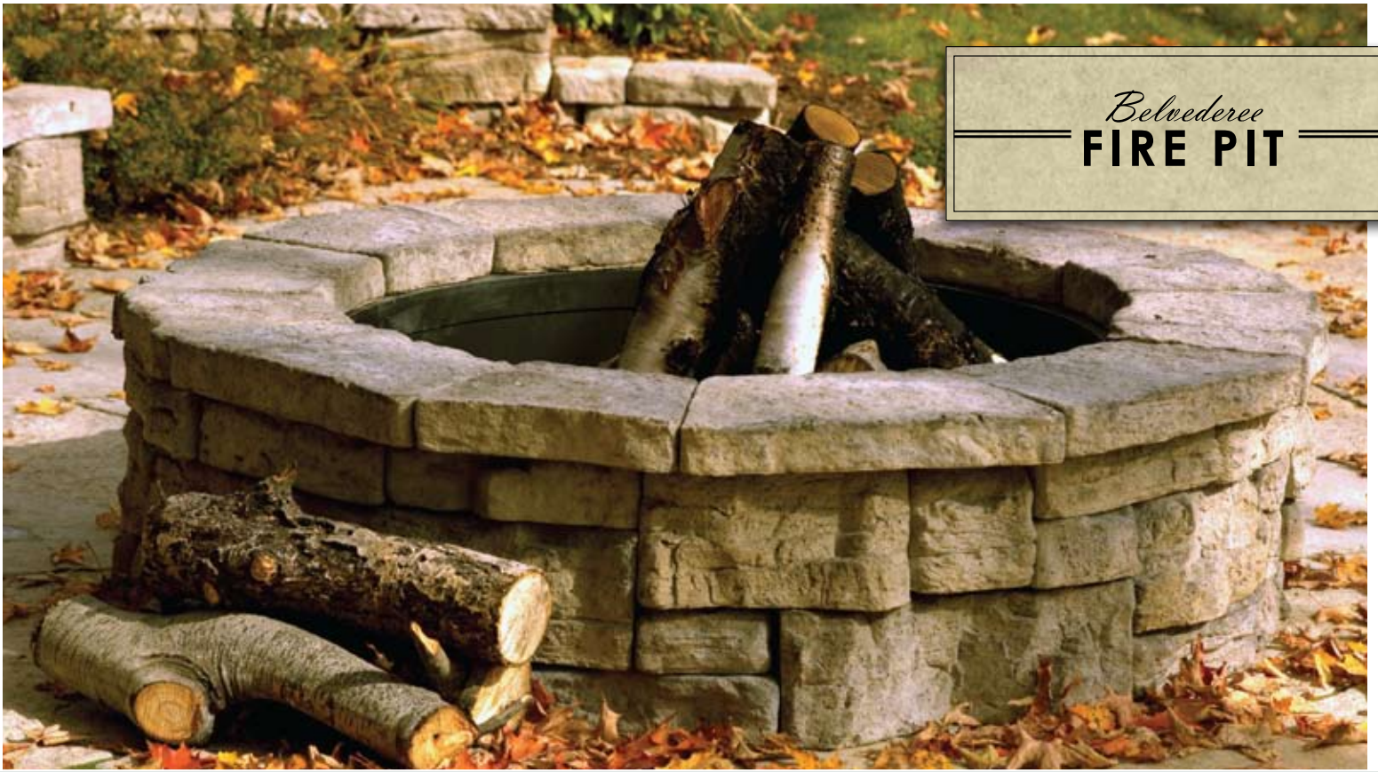
Belvedere FIRE PIT